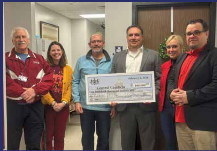
Rep. Burns delivered a $100,000 state grant from the Pennsylvania Department of Education to the Central Cambria School District.