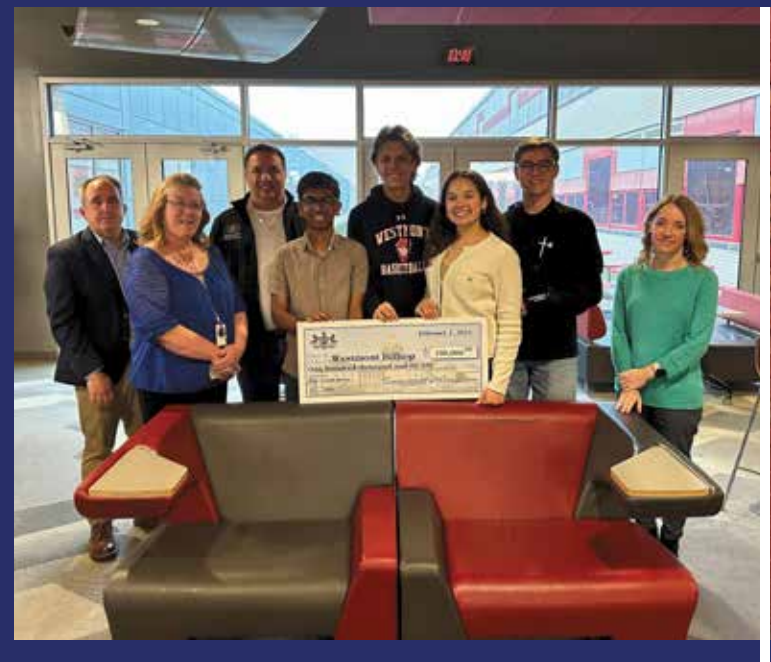
Rep. Burns brought $100,000 to Westmont Hilltop School District to give students better access and success in improved STEM education and AP classes.